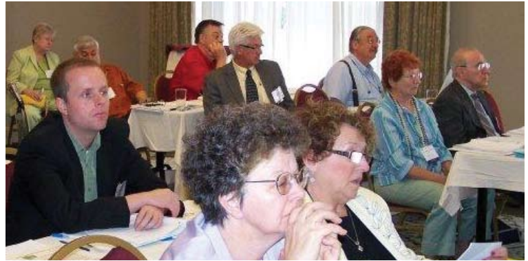
Members listen to reports.