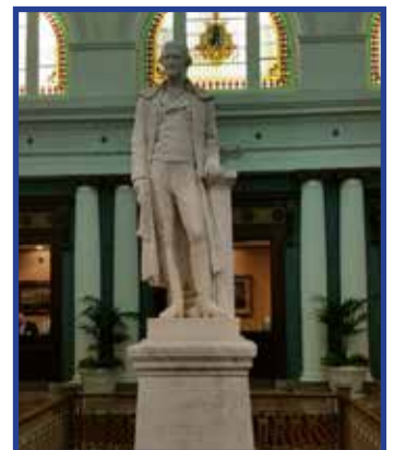
Thomas Jefferson was America's first parliamentarian, writing Jefferson's Manual of Procedure, still in use in the Congress today.

Although the ADA meets but once a year, it is hoped that a second electronic meeting would satisfy the AIP Bylaws meeting requirements.